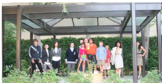
Back to School Bash 2010 Fashion show models.