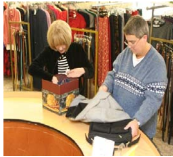
Two wonderful and dedicated Job Outfitters volunteers accessorizing an outfit for a client.

Last year, the program assisted more than 750 women. Please call 434-3494 ext. 125 to donate to Job Outfitters or to volunteer. Monetary donations are greatly appreciated.