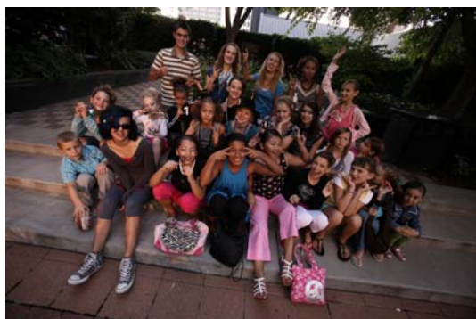
Models from Back to School Bash 2009

Save the Date: Art and Sole is October 21 at the Lincoln Country Club. Bidding starts at 6 p.m.