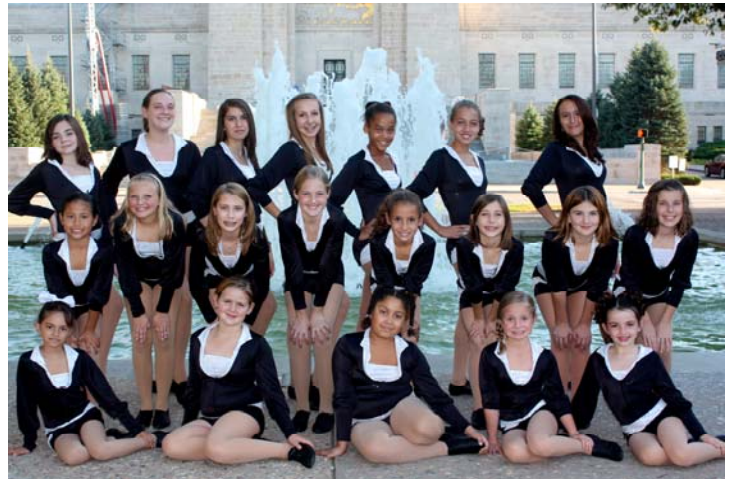
Congratulations to the 2010-2011 En Pointe Dance Academy DanzXplosion Team!