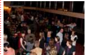
Thank you to every one that attended.